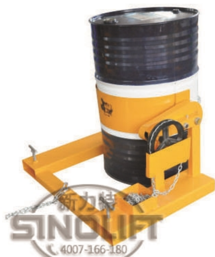
HK285A搬运夹 (链轮翻转) (Wheel chain flipping)