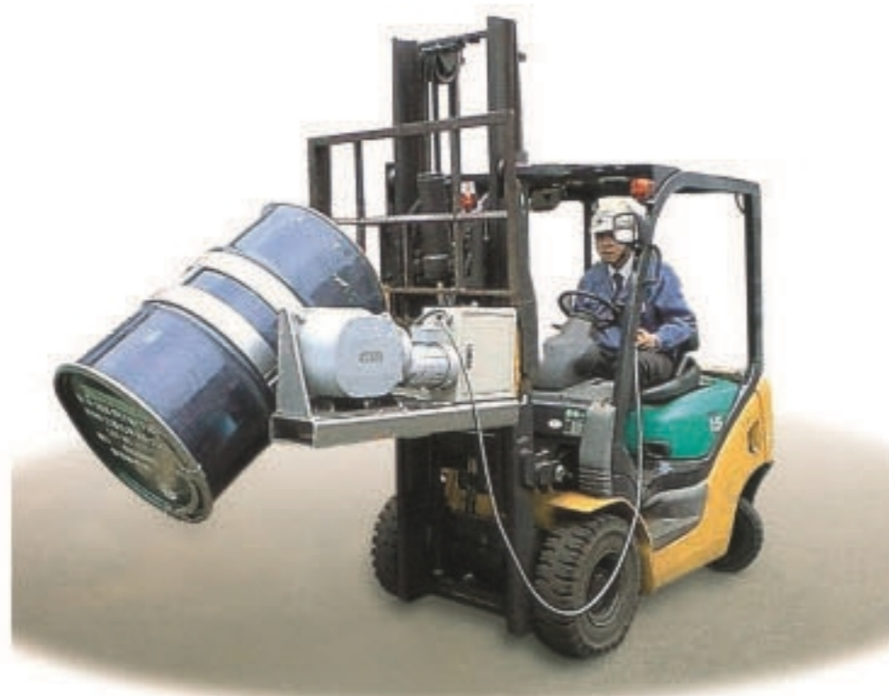
HK285D搬运夹 (电动多功能) (electric & multifunctional)