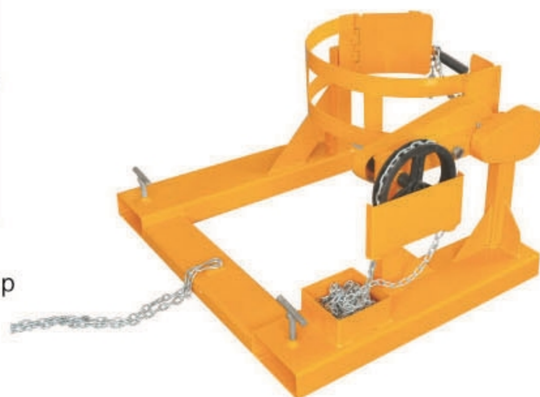
HK285B搬运夹 (重载链轮翻转) (Heavy-duty wheel chain flipping)