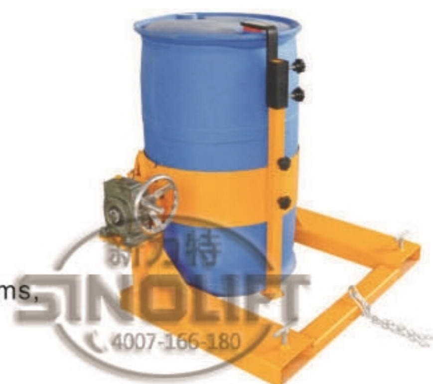
HK285C搬运夹 (蜗轮翻转) (worm gear flipping)