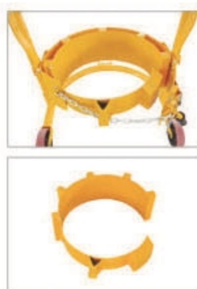
30加仑抱箍 30 gallon hoop